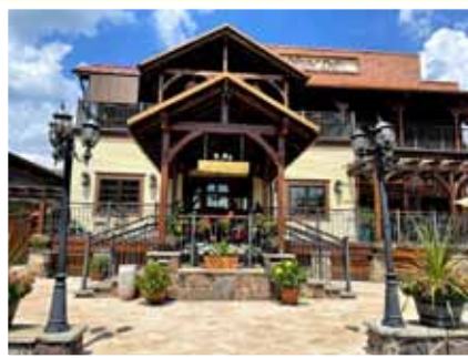
Hiddenite, North Carolina