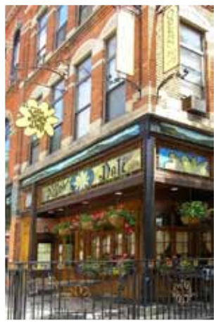
Oneonta, New York