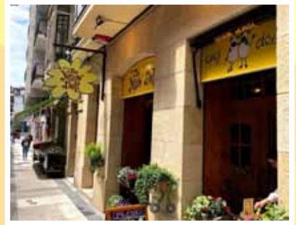
San Sebastian, Spain