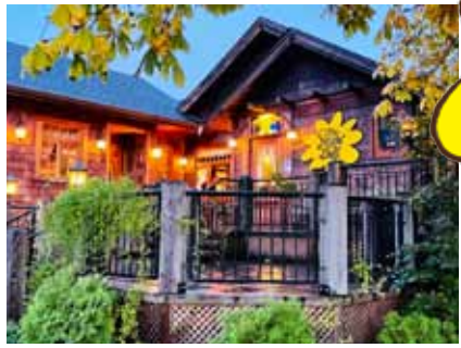
Courtenay, BC, Canada