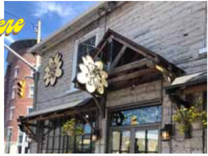
Kingston, ON, Canada