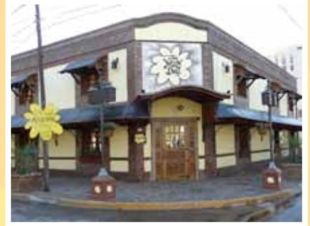
near Buenos Aires, Argentina